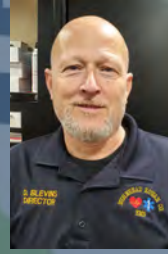
Danny Blevins Ambulance Service

To report a road concern, visit rcky.us/road-department-1 . There are multiple methods of contact, or you can fill out an online form directly on the page.